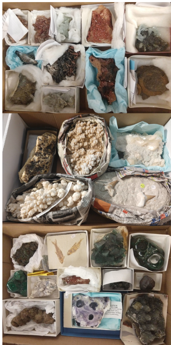
Items from Tucson to be featured at Rock and Gem Show

As you can see there are many areas that club members can participate in during the show. I hope you will join us in April.