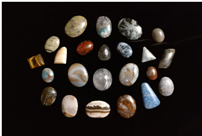
Assorted Cabochons by Beverly House