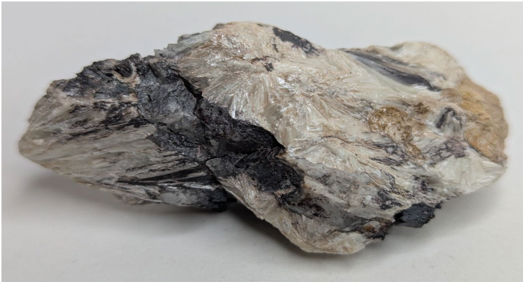
Pyrophyllite with Oxide Minerals for Orange County, NC

This month's mineral is Pyrophyllite, a phyllosilicate mineral containing aluminum, silicon and oxygen. This soft, light-colored mineral is most notable for its spectacular radiating sprays which can grow quite large. The pearly luster of the mineral, as well as its often-pure white color adds brilliance to these eye-catching specimens. Pyrophyllite is very much a local star in the Tar Heel State. Mining goes back to the early 1800's and its local abundance has been the subject of multiple studies by the NCGS and USGS. It's still mined commercially in Hillsboro, where it serves a number of commercial applications, including use in ceramics and insecticides.