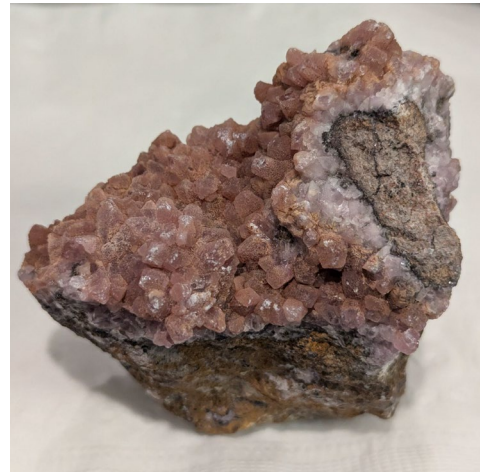
Door Prizes which included polished Malachite and Cobaltine Calcite