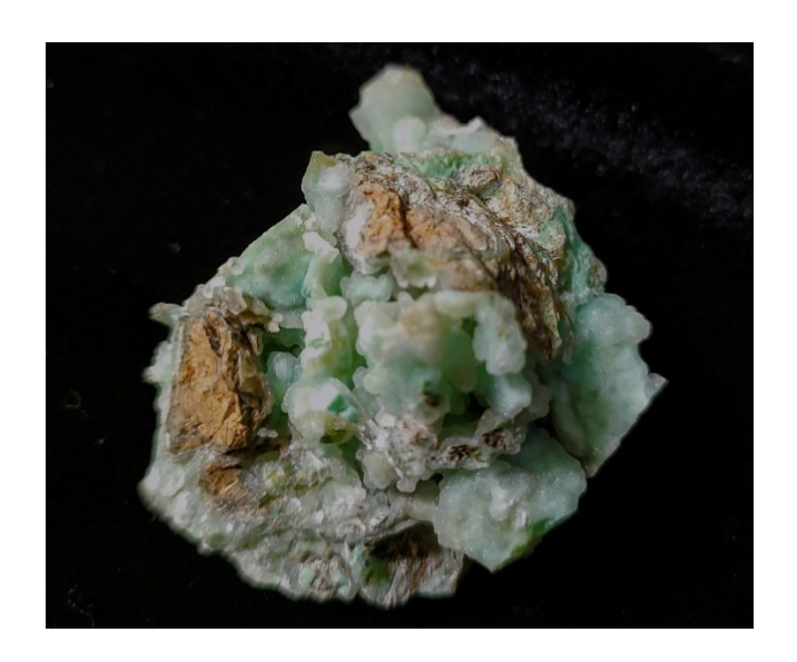
Quartz w/Garnierite (Sulawesi Indonesia)