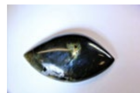
Labradorite Cabochon, Local Unknown