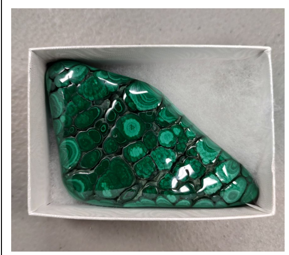
Malachite-selected by Owen N.