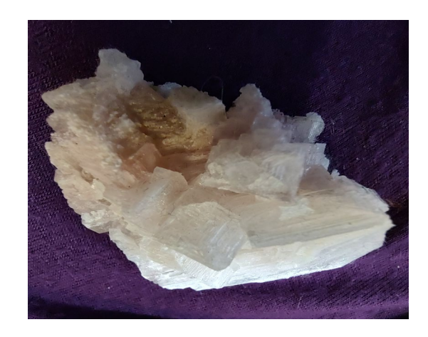
Halite (Pink Salt) Searles Lake Mohave Desert, CA.