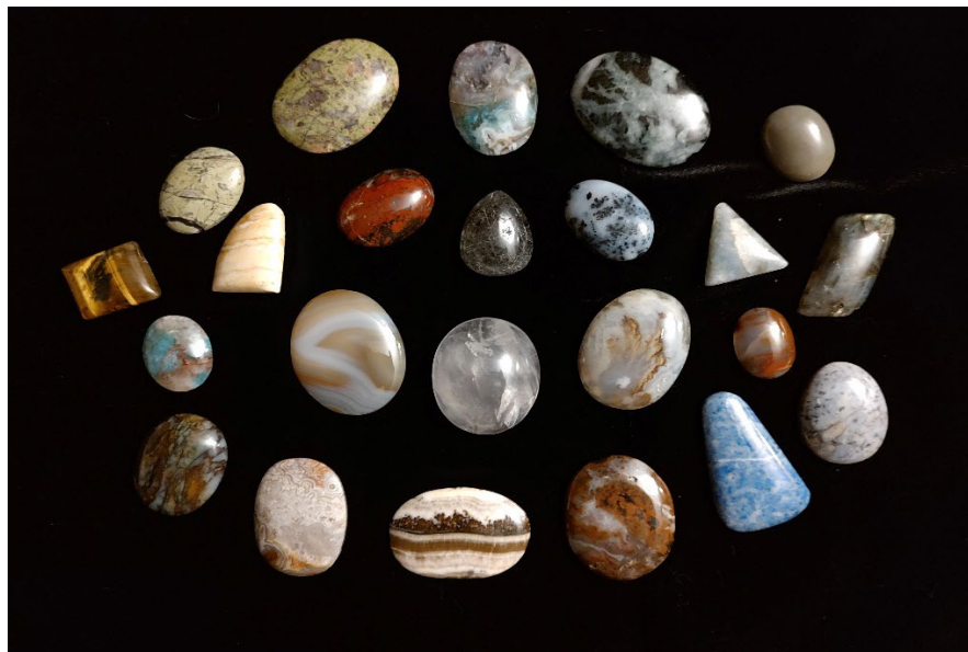
Assorted Cabochons, cut by and