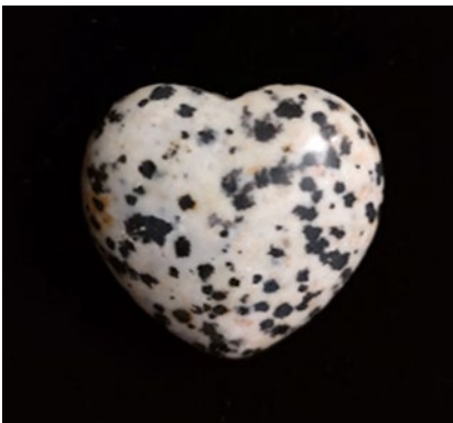
Dalmatian Jasper Heart

*Those who sign up to work the show for 5 hours or more will be eligible for one of our gift card drawings.