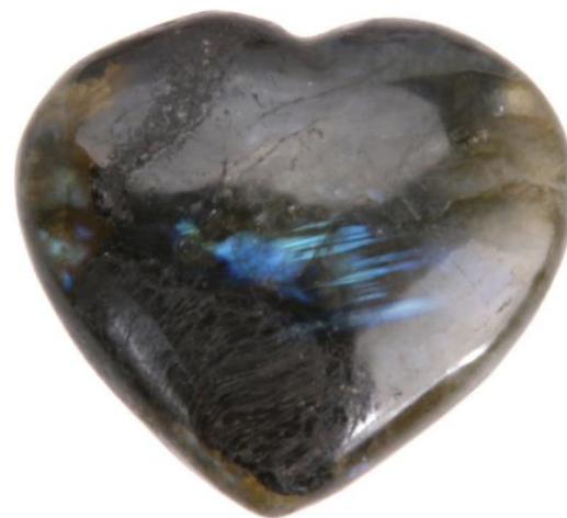
Chinese Labradorite https://www.brettonrocks.com

As many as 2,000 years ago, Native Americans in the spruce pine area were mining mica to use as currency and decorate grave sites. More recently, around 1744, the local tribes found a market for the feldspar that was a by-product of their mica and aquamarine mines. They loaded up carts of feldspar for English colonists for use in ceramics. Scotch-Irish farmers in Mitchell County also mined their land for mica, considering continued on page 4